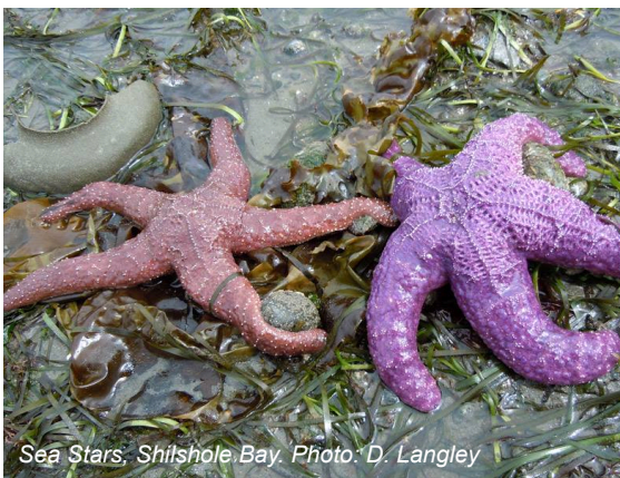
Sea Stars, Shilshole Bay.

Another fun-packed school year draws to a close. We had a lot of fun, learned loads of new things, and made new friends. Thank you all for making the 2016/17 school year so enjoyable! Who's ready for summer school!